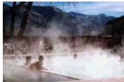
Trimble Hot Springs

Whether you're visiting in winter or summer, you'll find an almost endless array of exciting things to do in Durango and the four corners region.